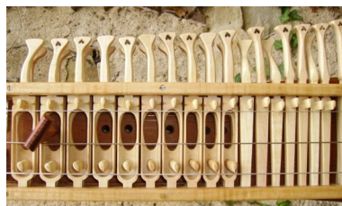
2 rows and a drone

The purpose of the workshop is to make a nyckelharpa, a Swedish keyed fiddle. It can be equipped with a two-row keyboard (D - A) and a drone (G) to be tuned with a small wooden key (capo), or a four-row keyboard (C - G - D/C - A). I adapted the shape so that non professional people can make the instrument in a relatively short time, that is to say more or less 10 days. A kit will be provided with already roughed out parts.